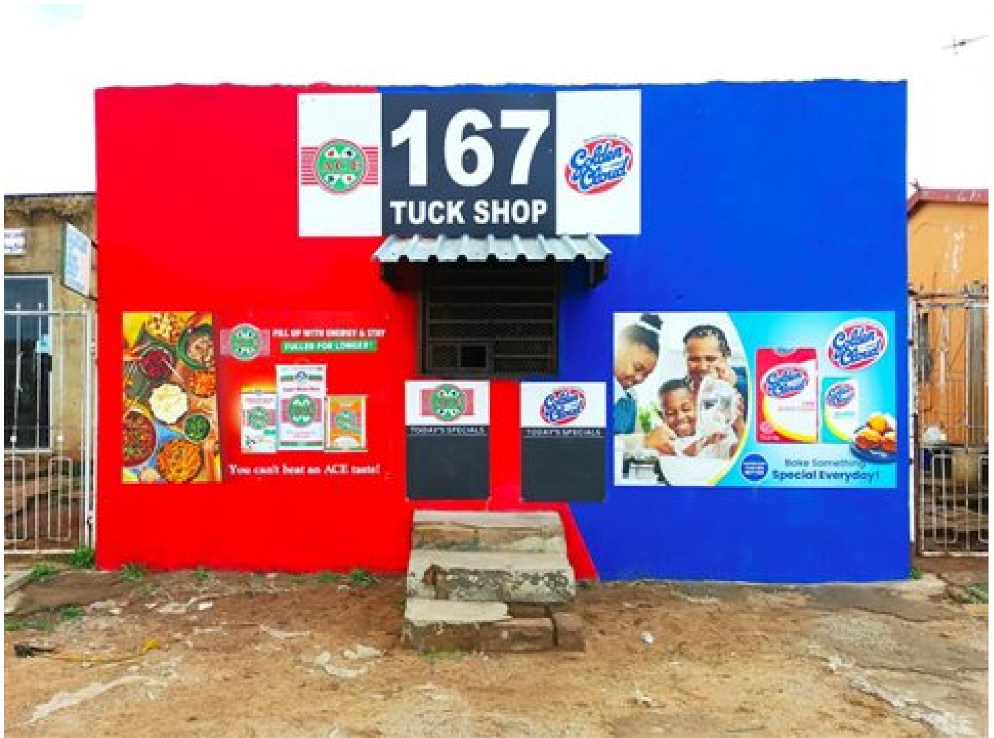
After – Golden Cloud and Ace spaza branding