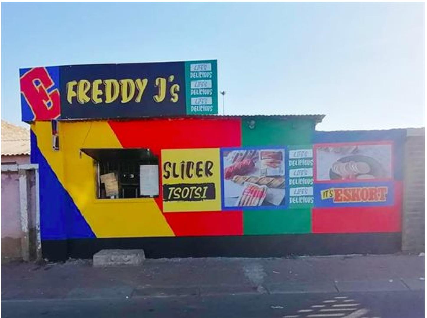
After – Eskort spaza branding