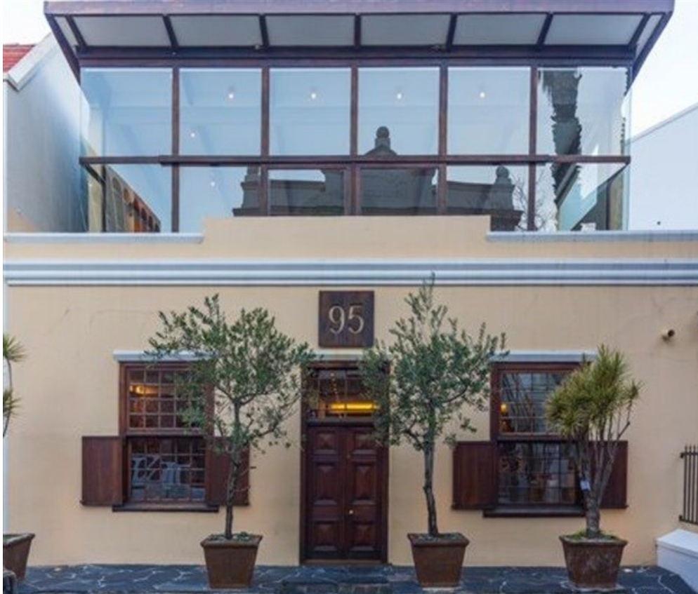
95 Keerom exterior.

Those of us who work in or around the CBD but travel long distances to the Cape suburbs at the end of the workday can rejoice at the chance to finally incorporate corporate (or not) Italian Friday business lunches at 95 Keerom - formerly only open for dinner - into our bustling schedules.