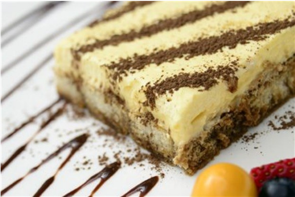
Tiramisu. All images provided.

Served fresh from the oven and warned of the 15-minute waiting time, those fondants were pure mounds of delight, filled with warm, liquid centres. I merrily made my way through the white one bursting with white rum, and the dark ball of pure chocolate.