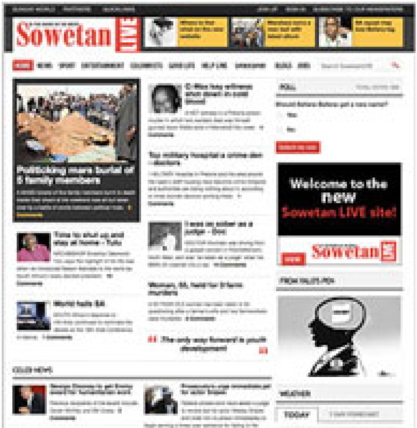
Sowetan Live (www.sowetanlive.co.za)