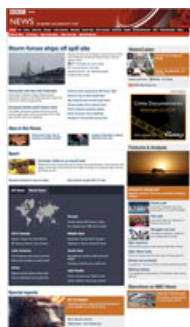
BBC News ( www.bbc.co.uk/news ) click to enlarge

Now I know you can't keep everyone happy. People by nature detest change. In addition, the criteria involved in designing a site like this is onerous, to say the least. But notifying people of a "major relaunch" fuels expectations that you might not, or cannot, fulfil. Let's be honest - every time Facebook changes its interface (mostly minor) and lets people know beforehand, the resultant furore is explosive.