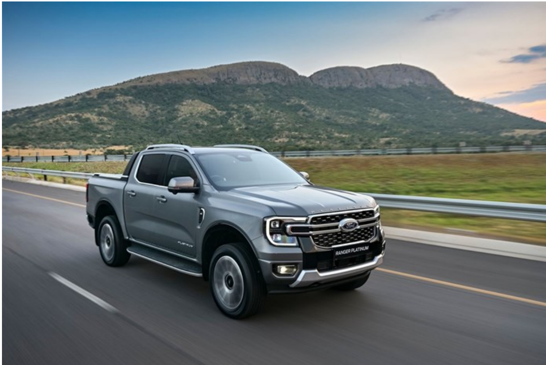
Ford Ranger Platinum

Ford Motor Company Southern Africa has strategically added more finesse to its Ranger bakkie lineup in the local market with the introduction of two new models that serve a niche type of customer. President of the Blue Oval's local arm Neale Hill said at the media launch of these new derivatives that the double-cab Ranger has outsold its rival the double-cab Toyota Hilux last year, so therefore an expanded lineup makes sense to further capitalise on the success of the new generation Ranger bakkie.