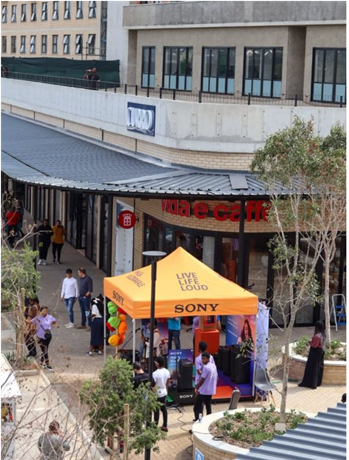
Barlow Park retail opening

This community-centric redevelopment garnered solid stakeholder backing. Moolman Group and Twin City Development are also investors in Barlow Park.