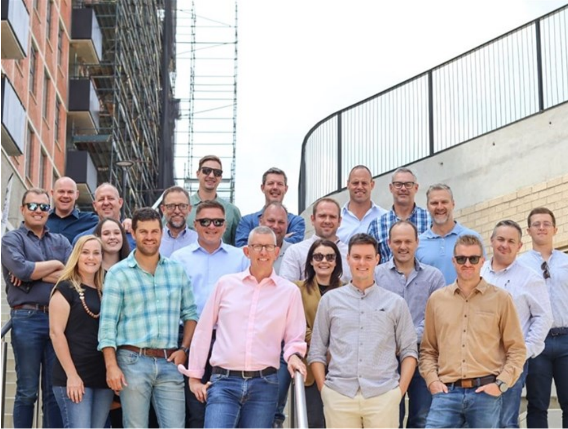
Barlow Park development team

The iconic new Barlow Park has revitalised and transformed the site of the former Barloworld headquarters in Sandton into a contemporary mixed-use precinct, with the much-anticipated opening of Barlow Park Retail on 29 February 2024.