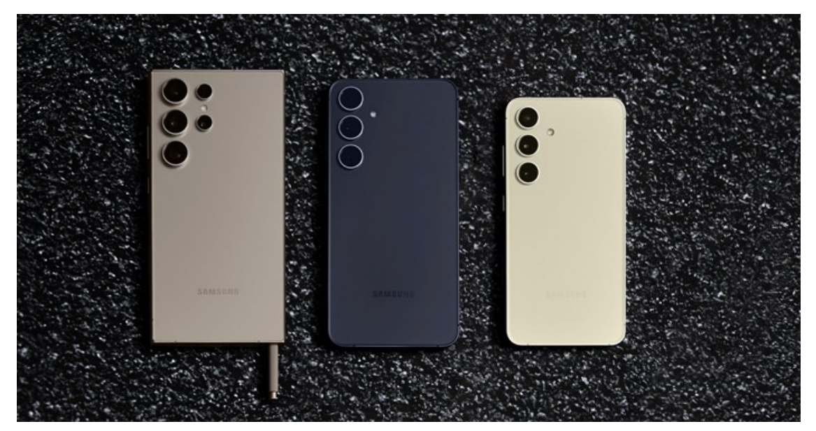
Samsung managed to increase the screen size of the S24 series over its predecessors, but in the same handset size.

Samsung didn't talk about hardware when it <u>launched the Galaxy S24 series</u> at the SAP Center in San Jose on Wednesday. Instead, the former best-selling smartphone vendor – <u>Samsung was dethroned by Apple this week</u> – took its prime-time opportunity to rather showcase AI capabilities that are powered by innovations from technology partners Google, Qualcomm and AMD.