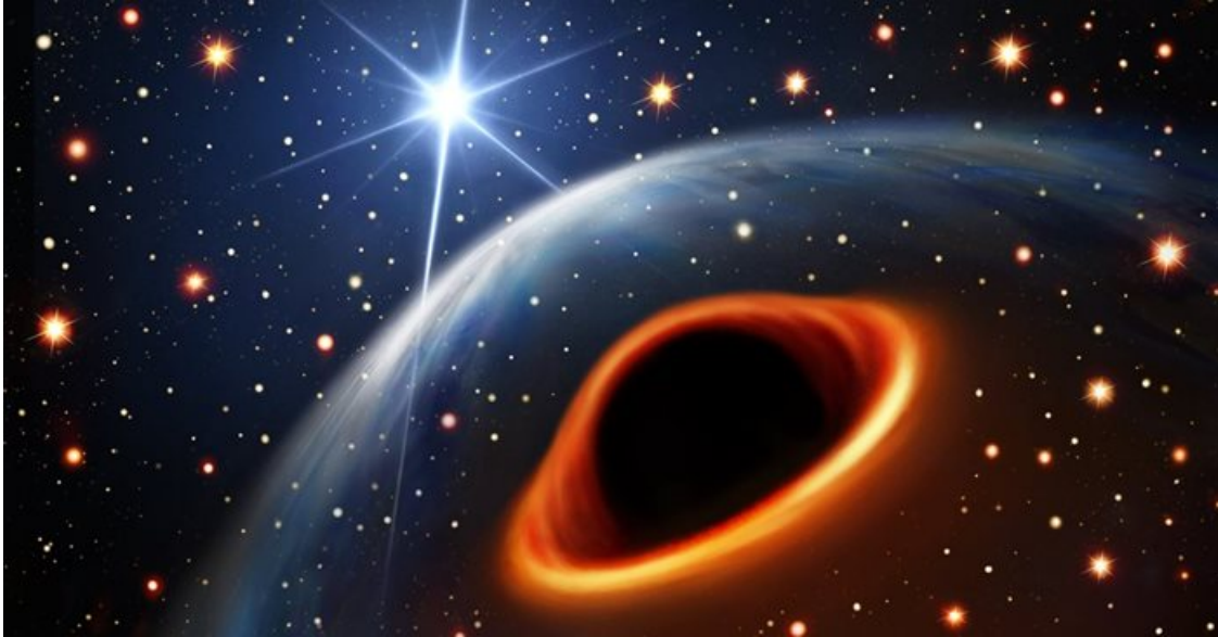
An artist's impression of the system assuming that the massive companion star is a black hole. The brightest background star is its orbital companion, the radio pulsar PSRJ0514-4002E. The two stars are separated by 8 million km and circle each other every 7 days.