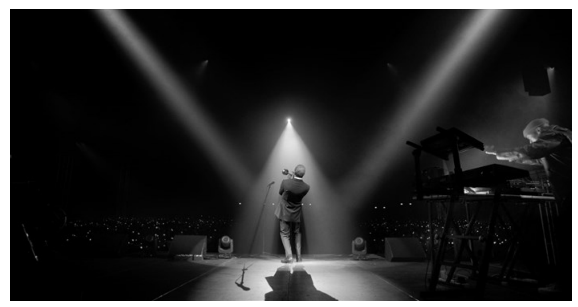
Image supplied. The latest in Allan Gray's catalogue of ads, Everything comes around

The latest in Allan Gray's catalogue of ads, Everything Comes Around is a black and white film that portrays the life of a jazz musician from the late 40s whose commitment to his craft is unwavering, even as musical trends come and go.