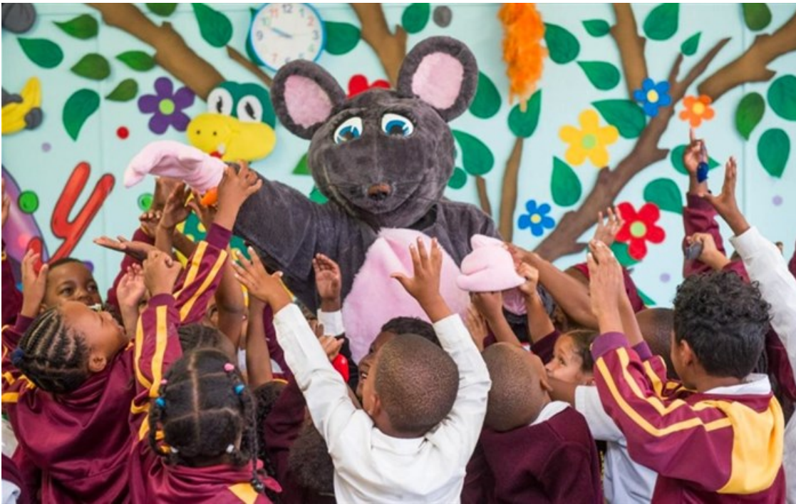
Coronation and its literacy partner Living Through Learning hosted the city-wide occasion at the schools' fun-filled Reading Adventure Rooms.

Coronation and its literacy partner Living Through Learning spread joy at all their beneficiary schools and Reading Adventure Rooms in Cape Town as the learners read The Mouse Who Ate the Moon .