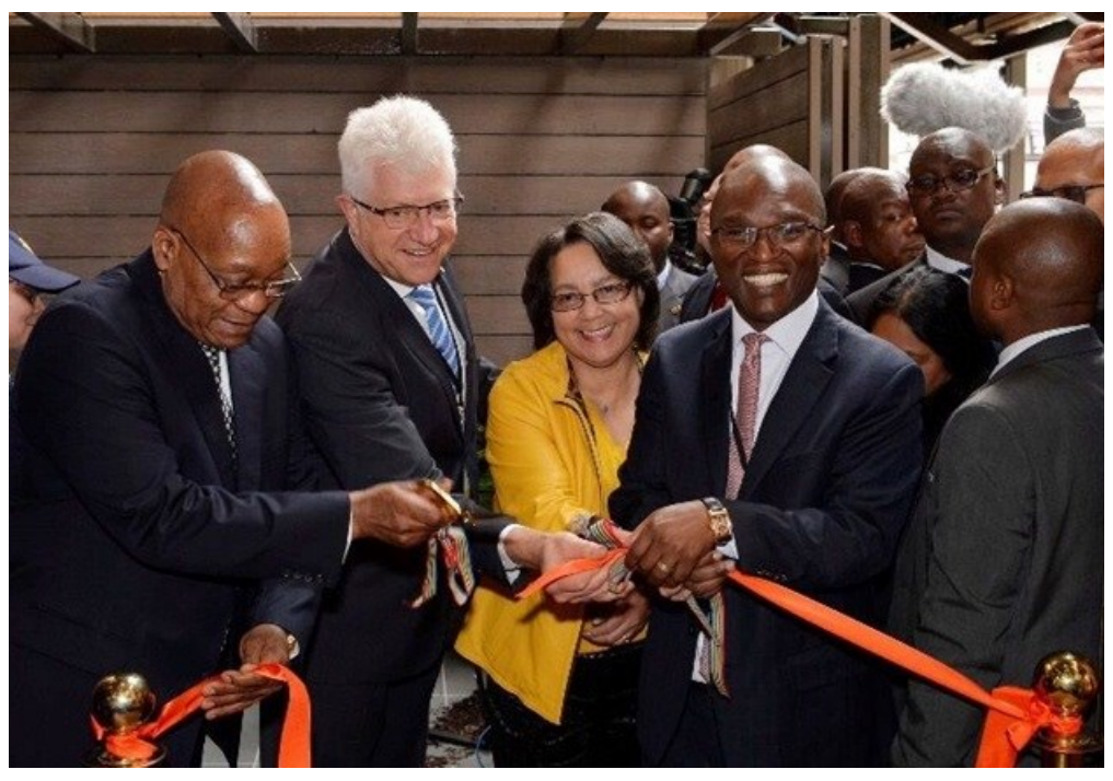
Ribbon cutting of the InvestSA OSS.

Under the banner of investment promotion, Wesgro's Trade, Investment and Film Units hosted 13 inward mission strategic conferences and sector events specific to the One Stop Shop, such as the Safta judge's meeting; there were 20 corporate engagements; 9 inward missions with delegations from Asia, Europe and the USA; as well as 17 stakeholder engagements.