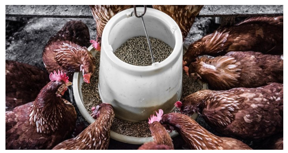
Chicken feed is one of the rising costs of farming.

The University of Georgia's Poultry Science Department, in collaboration with funding from the World Poultry Foundation, has introduced the FeedMixer app. This solution aims to tackle one of the most pressing challenges faced by chicken farmers across the globe: optimising chicken feed in the face of soaring commercial feed costs and limited access to specific grains.