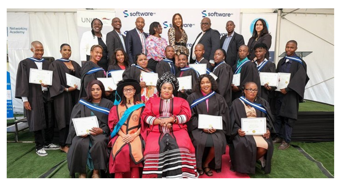
Lindamahle Innovation Centre graduates.

The Department of Communications and Digital Technologies (DCDT), in collaboration with a host of partners including Cisco, Software AG, the International Labour Organisation, The Deutsche Gesellschaft für Internationale Zusammenarbeit (GIZ), MICT SETA, and the National Electronic Media Institute of South Africa, celebrated the graduation of 41 students from the Lindamahle Innovation Centre.