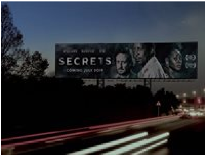
Film - Gold