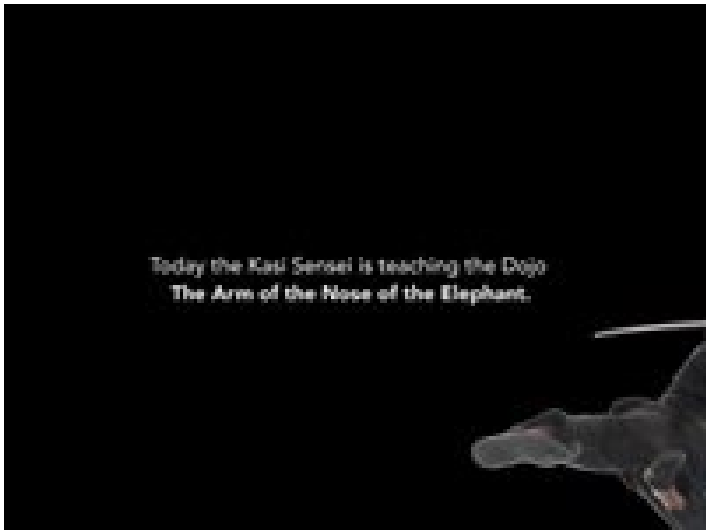
Grand Prix - Grand Prix