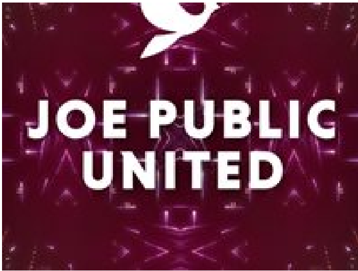
Regional Agency Group of the Year