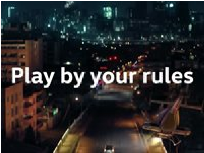
Film - Silver