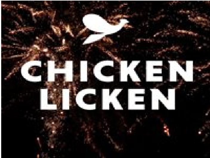
Brand of the Year

For more, visit: https://www.bizcommunity.com