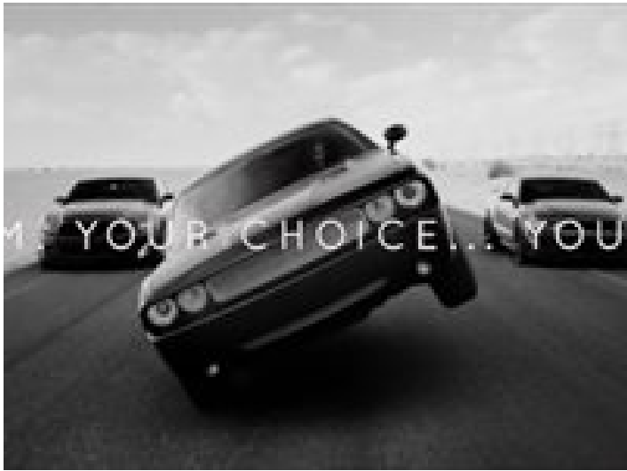
Film Crafts - Craft Gold