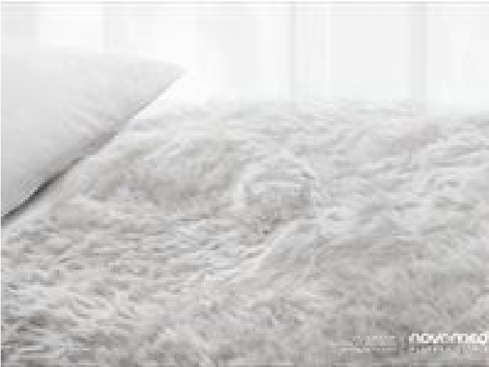
Grand Prix - Grand Prix