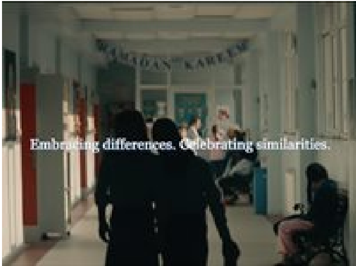
Film Crafts - Craft Gold