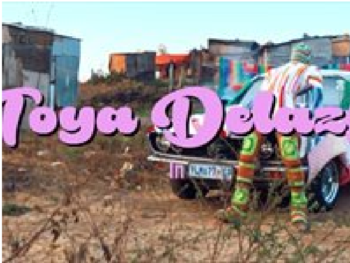
Film - Bronze

The Loeries concluded the 2020 awards with Film, Film Craft, Grand Prix, Brand of the Year, Agency of the Year award, Regional Agency Group of the Year awards. Throughout Loeries Creative Week, a total 264 Loeries were awarded across 16 categories, including five Grands Prix, 28 Golds, 63 Silvers, 110 Bronzes, 14 Craft Golds and 44 Craft Certificates. The awards honour the best in brand communications across Africa and the Middle East. Here is the gallery of winners from day five.