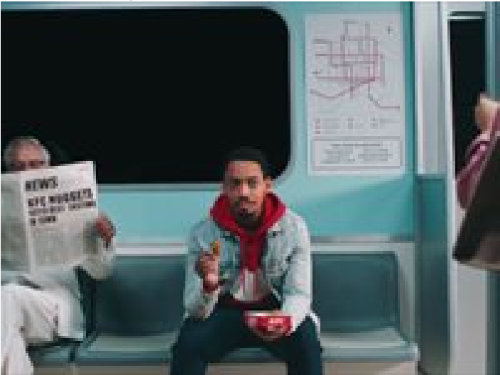
Film Crafts - Craft Certificate