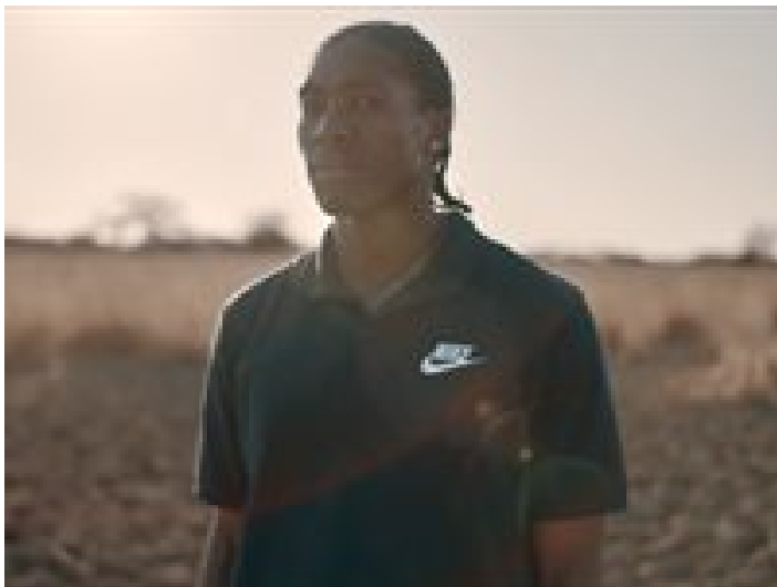
Film - Bronze