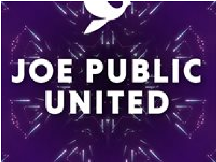
Agency of the Year Award