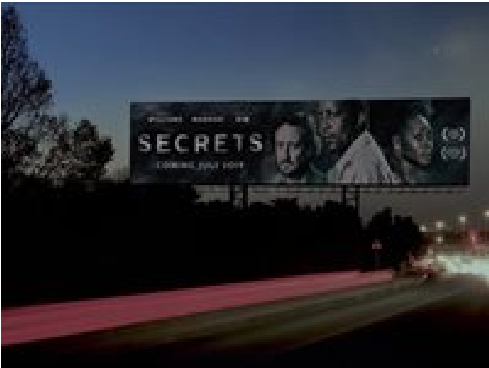
Grand Prix - Grand Prix