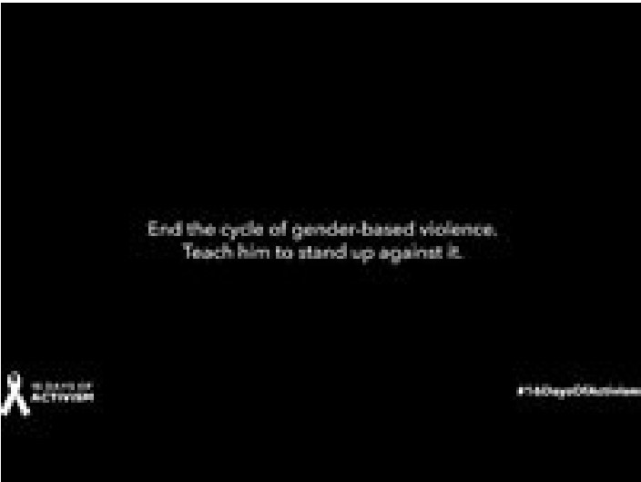
Film Crafts - Campaign Craft Certificate