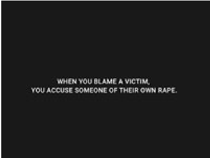
Film Crafts - Craft Gold