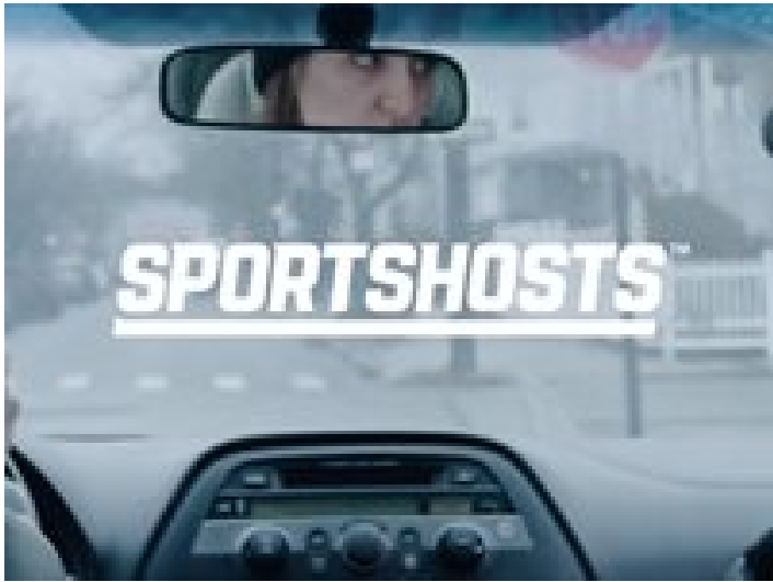
Film - Silver