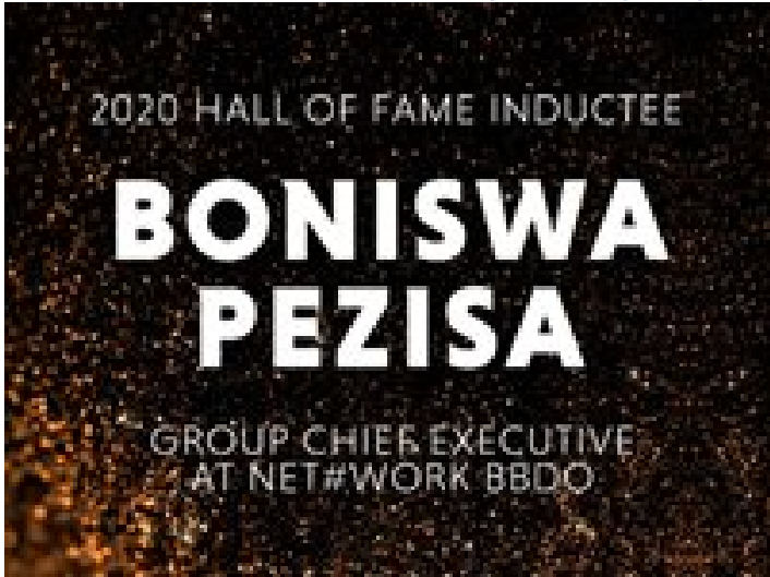
Hall of Fame