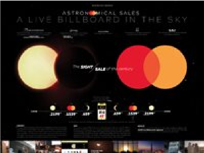
Grand Prix - Grand Prix