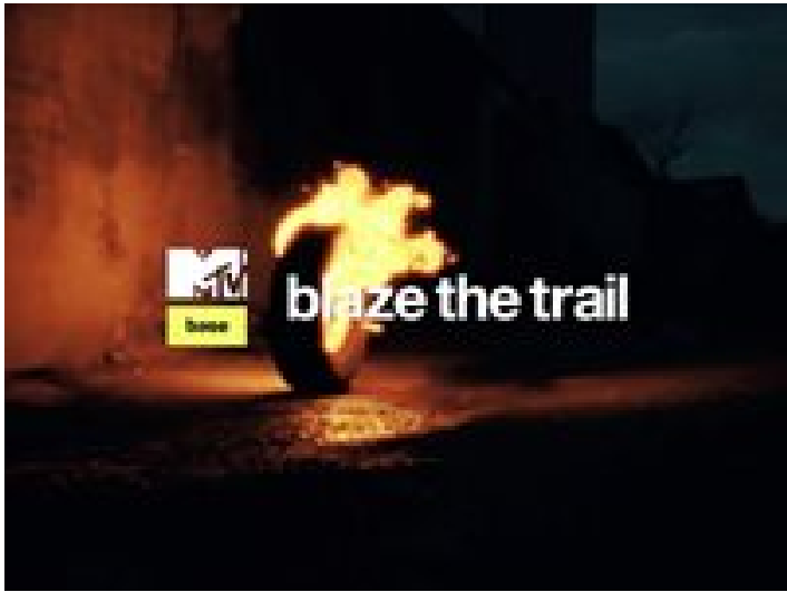
Film Crafts - Craft Certificate