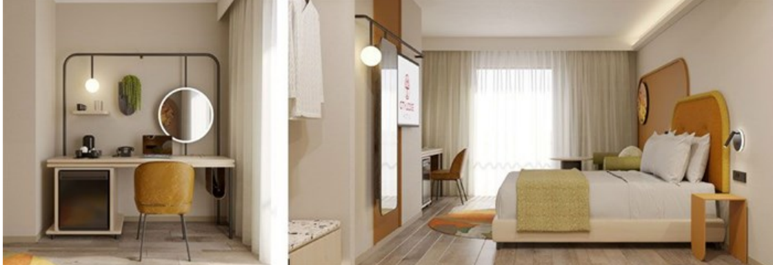
Artist impression of new guest rooms at City Lodge Hotel V&A Waterfront