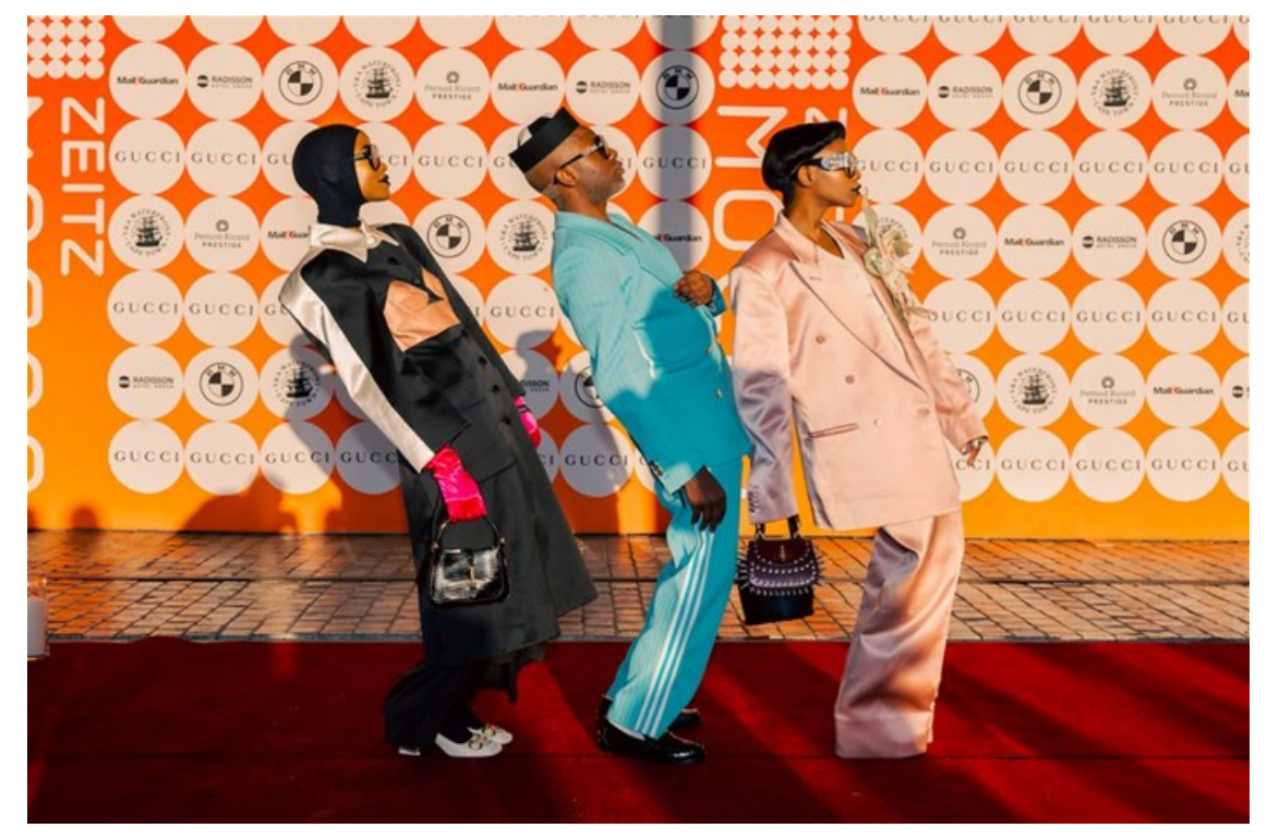
Sibling collective Dear Rebane, dressed in Gucci.

Highlighting the significance of the evening, Kouoh added: "We will be presenting our prestigious Zeitz Mocaa Honorary Awards for Artistic Excellence and Philanthropic Achievements, recognising those who have made exceptional contributions to our art ecology and to our mission. It's a moment to honour the visionaries shaping the thriving landscape of contemporary art in Africa."