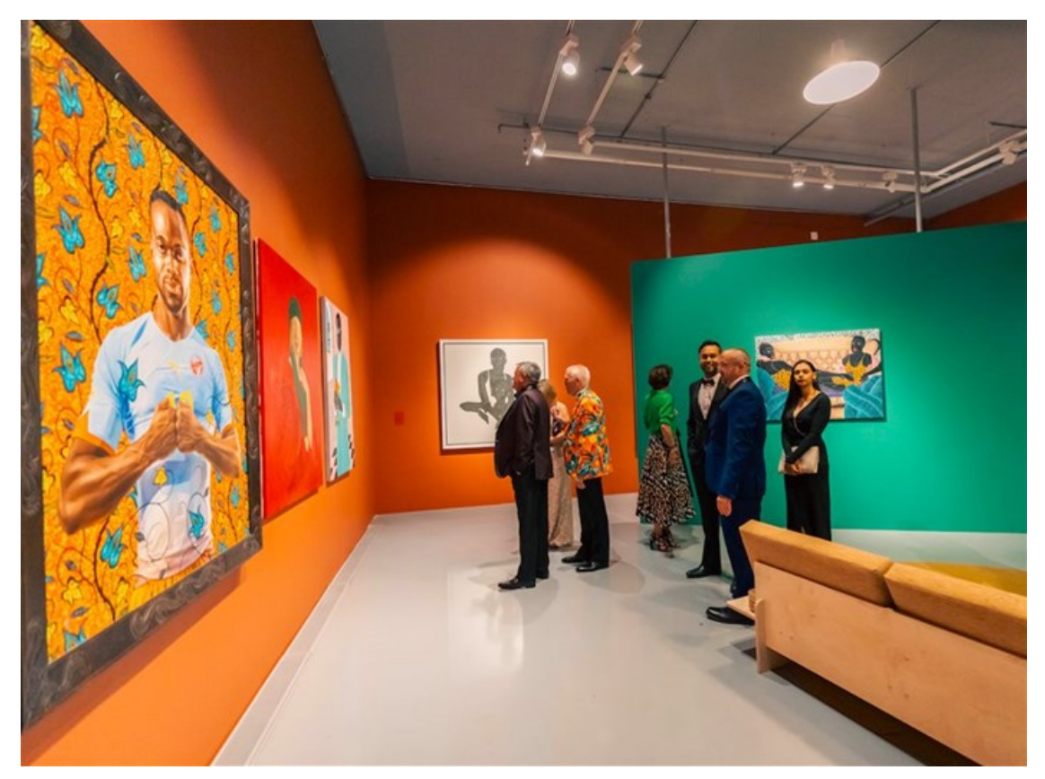
Patrons of Zeitz Mocaa enjoy an exclusive preview of the new survey exhibition titled When We See Us: A Century of Black Figuration in Painting ahead of the show's opening on Sunday, 20 November 2022.

Zeitz Museum of Contemporary Art Africa (Zeitz Mocaa) is thrilled to announce the highly anticipated annual Zeitz Mocaa Fundraising Gala, set to take place on Sunday, 11 February 2024 at the iconic museum premises. This enchanting evening promises to be a celebration of artistic excellence as the institution raises funds to support their curatorial and education programmes.