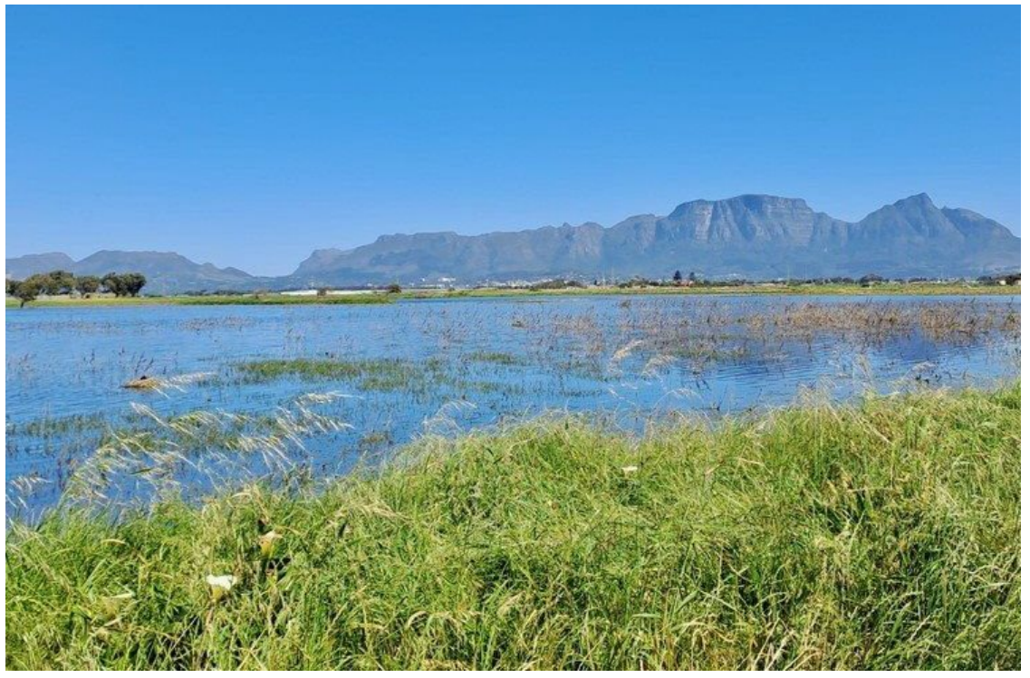
The area in the Philippi Horticultural Area (PHA) where Keysource Mnerals is proposing to mine.

A silica sand mining company that has set its sights on 50 hectares of land in the Philippi Horticultural Area (PHA) in Cape Town is appealing against the decision by the Department of Water and Sanitation (DWS) to refuse it a water use licence.