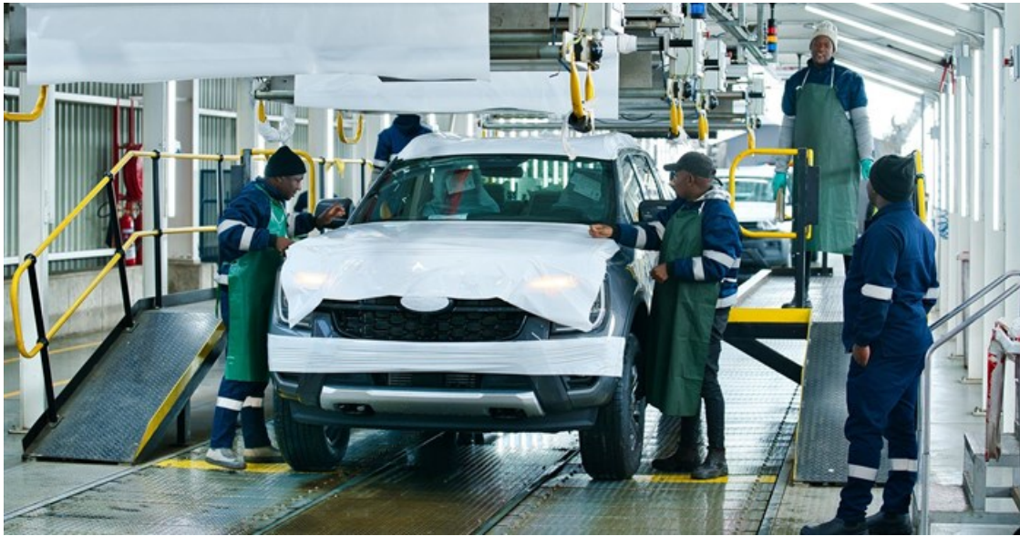
Ford Ranger production line at the Silverton assembly plant.

South Africa's automotive industry recorded a 14% increase in new car sales in 2022, with 298,901 vehicles sold, according to the latest data from the National Association of Automobile Manufacturers of South Africa (Naamsa). However, the sector still faces challenges and uncertainties, as evidenced by a 3.1% drop in sales in August 2023 compared to the same month last year.