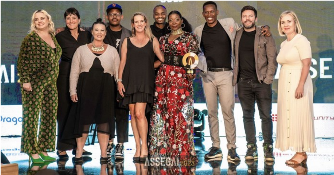
Ogilvy SA won 42 Assegai Awards and was awarded the Nkosi Award at the Assegai Integrated Marketing Awards

Ogilvy South Africa was awarded the Nkosi Award at the Assegai Integrated Marketing Awards which took place on Thursday evening at a glittering event at the Wanderers Club Johannesburg.