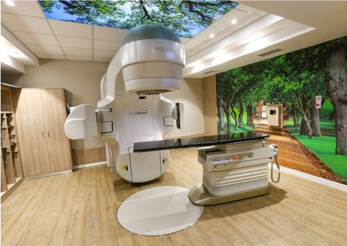
Icon Oncology commissioned a Varian Truebeam earlier this at its flagship integrated oncology unit based at Mediclinic Constantiaberg.