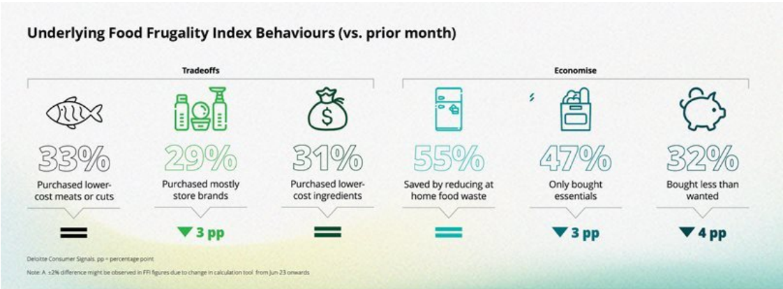
Highlights from the February 2024 FFI