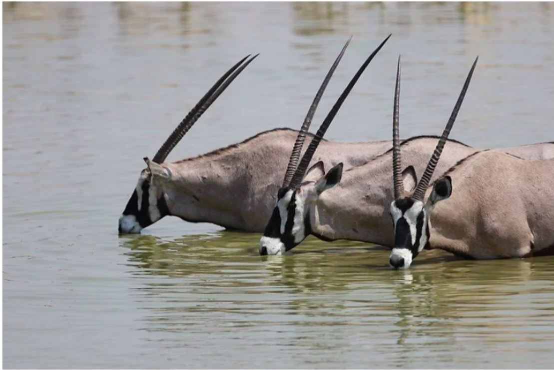
More than just humans rely on the pristine drinking water from our aquifers

If disaster strikes, the repercussions will be widespread. Yes, our drinking water would be jeopardised but many more areas would also feel the impact: