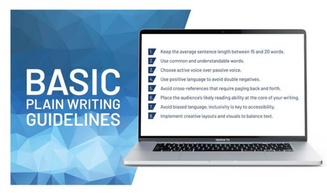
Figure 1: Summary of basic plain writing guidelines.

However, plain language is so much more than a set of guidelines for writing effective content. In fact, it has evolved into a global movement that places itself at the centre of accessible and equitable communication.