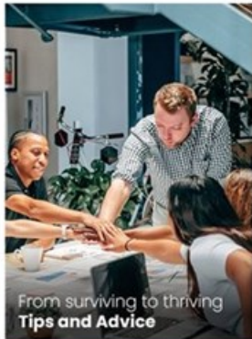
From surviving to thriving Tips and Advice