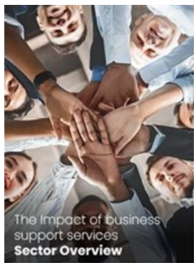
The Impact of business support services Sector Overview