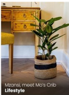
Mzansi, meet Mo's Crib Lifestyle