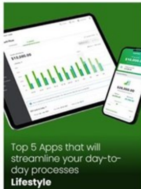
Top 5 Apps that will streamline your day-to-day processes Lifestyle