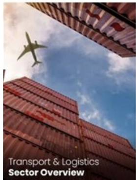
Transport & Logistics Sector Overview