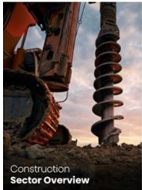
Construction Sector Overview