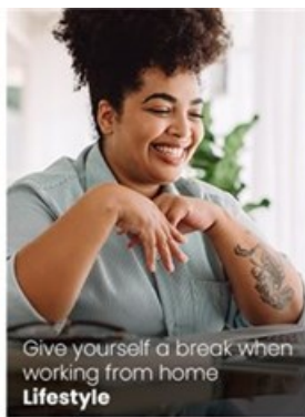
Give yourself a break when working from home Lifestyle