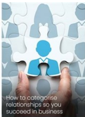
How to categorise relationships so you succeed in business Lifestyle