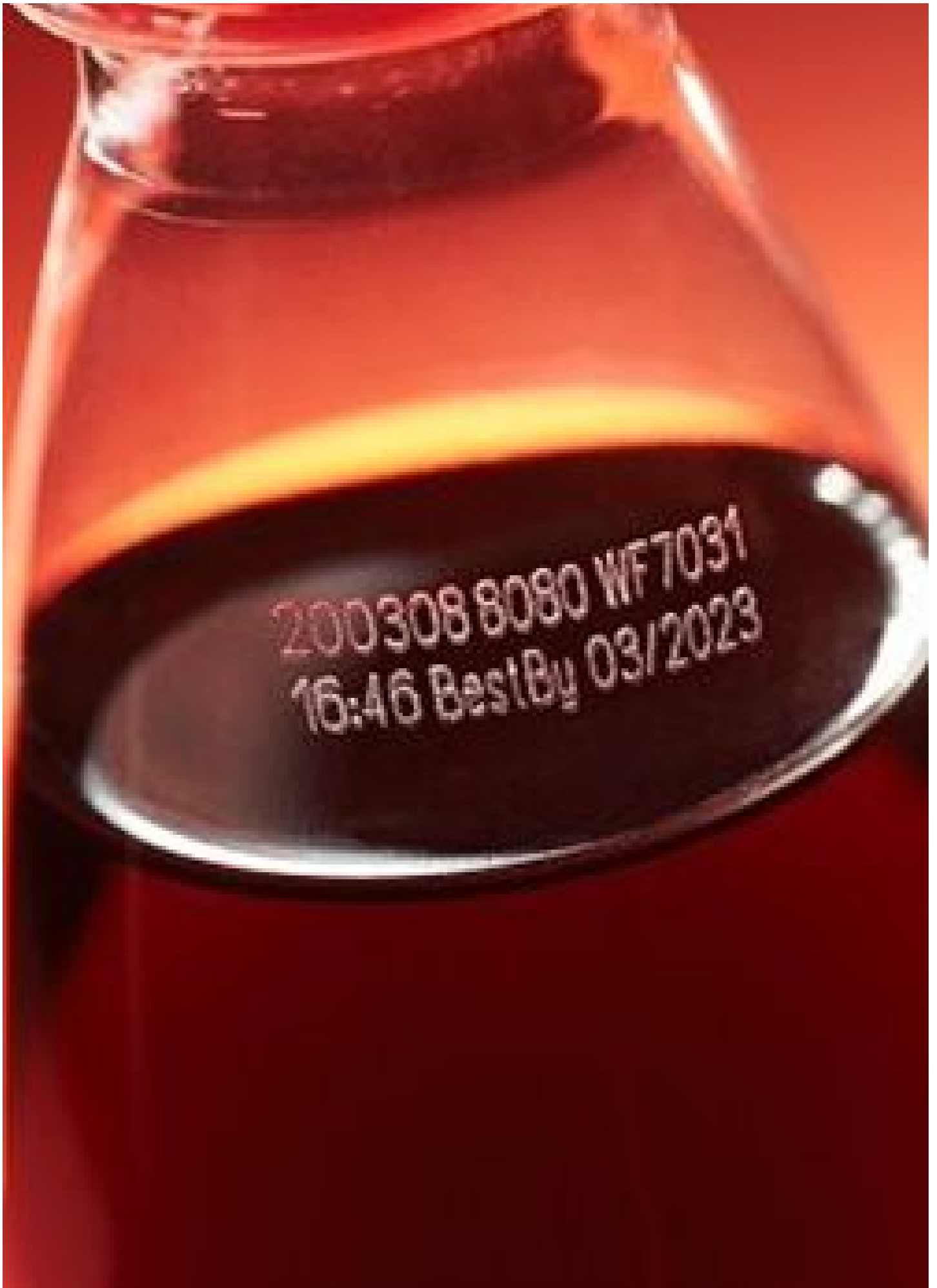
Laser coders work by changing the surface of the packaging material, either by ablation, etching or foaming. This makes