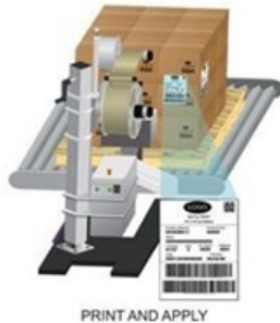
PRINT AND APPLY