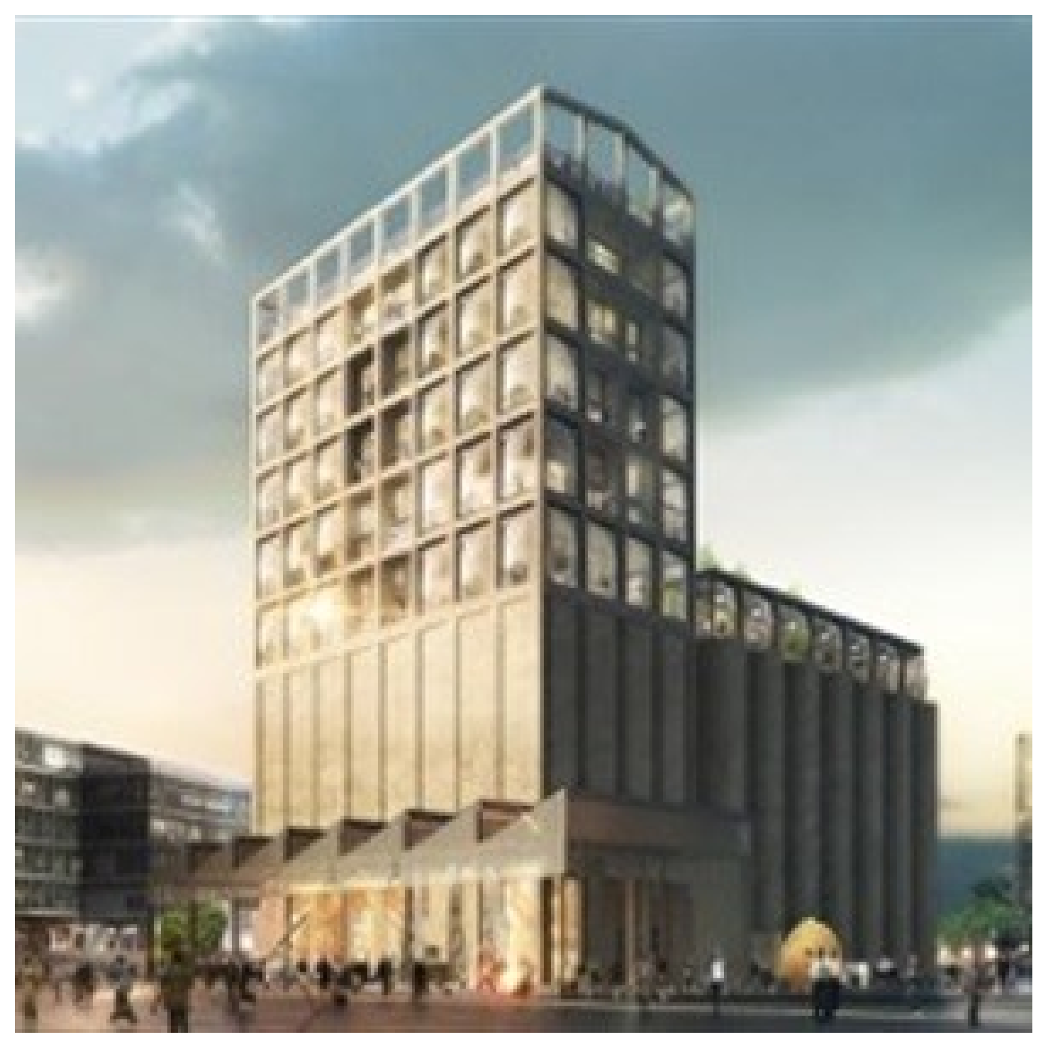
Exterior of the building