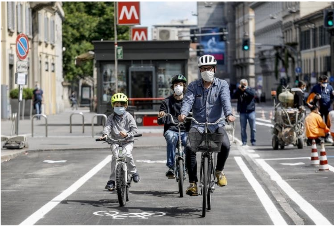
A family travels on a new bike path opened during lockdown in Milan, Italy.

In the worst-case scenario, road closures will be reversed, public transit systems will go bankrupt and their failure will starve them of public funds for the near future. More bus and rail services will be privatised, and car use will be the only reliable option left to many. Parking and congestion charges will be scrapped and driving promoted as the only safe mode of travel, while the newfound space for walking and cycling is withdrawn. The result will be more private vehicle traffic, more congestion, more air pollution and more social division.