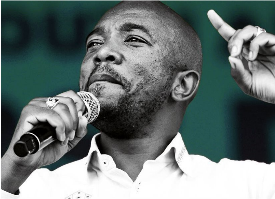
Mmusi Maimane, the chief activist of 'One South Africa' Movement

Mmusi Maimane, the chief activist of 'One South Africa' Movement (OSA), recently launched its digital platform to connect and engage with South Africans through these unprecedented times.