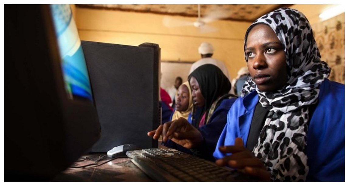
Computer scientists can make important contributions to fixing societal ills.

In Africa, a continent grappling with many social ills, it's critical that universities produce more Computer Science graduates. It's also one that equips students with crucial skills.