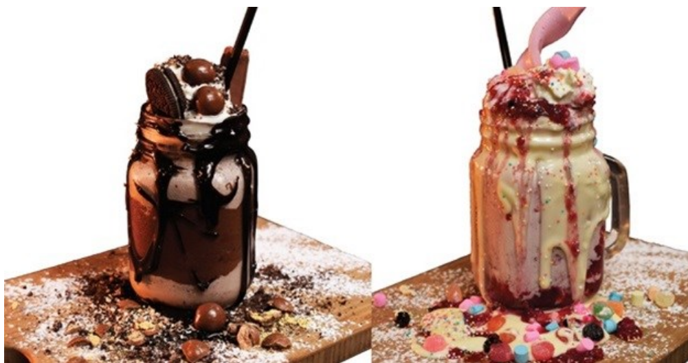
The Jackie Brown/slow death by chocolate and Cindy/Candylicious freak shakes.

I went with two of the specials advertised on the table – first, the Instagram-must ‘candylicious’ freak shake. It’s a swirly pink concoction in a Consol mug just brimming with whipped cream, hundreds and thousands, a twist of pink Fizzer and swirls of berry syrup. It’s also dotted with berry-flavoured Jelly Tots and dripping melted white chocolate down the side of the glass, both inside and out, just asking to be licked up with a finger. It got a few admiring glances on its way to our table, as did the neighbouring table’s chocolate version, the aptly named ‘slow death by chocolate’ – there’s also a ‘peanutology’ version, brimming with peanut butter, malted chocolate balls and more.