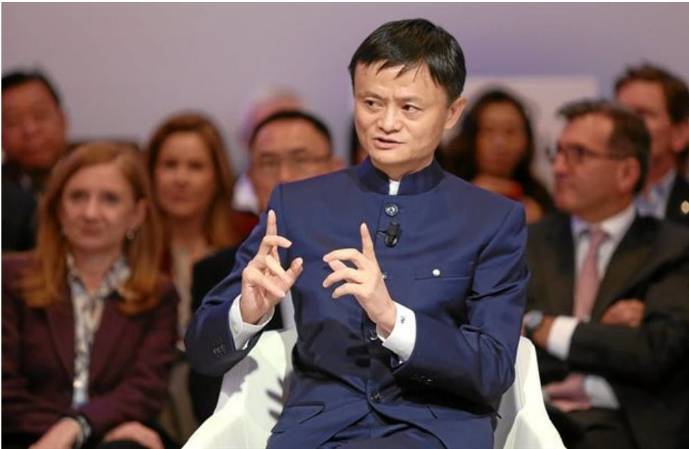
Jack Ma speaks at a meeting of the World Economic Forum Foundation in 2015.

In response to the ongoing coronavirus emergency, on 31 January, Chinese billionaire Jack Ma pledged the equivalent of $144m for medical supplies for Wuhan and Hubei as well as $14m to help develop a vaccine. Just a few months ago, the former teacher had left the reins of a company of more than 100,000 employees, valued $450bn, stating that he wanted to devote himself to philanthropy in the field of education . The emergence of the coronavirus threat showed his commitment to supporting public health efforts as well.